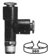
SWIVEL MALE RUN TEE