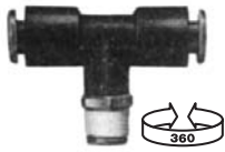
SWIVEL MALE BRANCH TEE