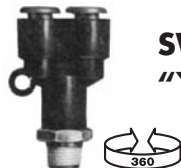
SWIVEL MALE "Y" CONNECTOR