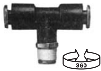
SWIVEL MALE BRANCH TEE